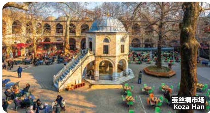
茧丝绸市场 Koza Han

· 倘若原定的景点不对外开放，将由其他景点取代。 · 以上的景点先后顺序可根据具体的情况有所调整。 · 在主要节日，商业展览，旅游旺季期间，住宿酒店可能需要安排在另一个城市。