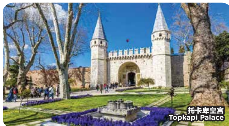
托卡卑皇宮 Topkapi Palace