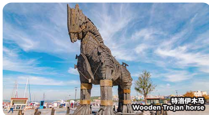
特洛伊木马 Wooden Trojan horse

Arrival Kuala Lumpur with happy memories.